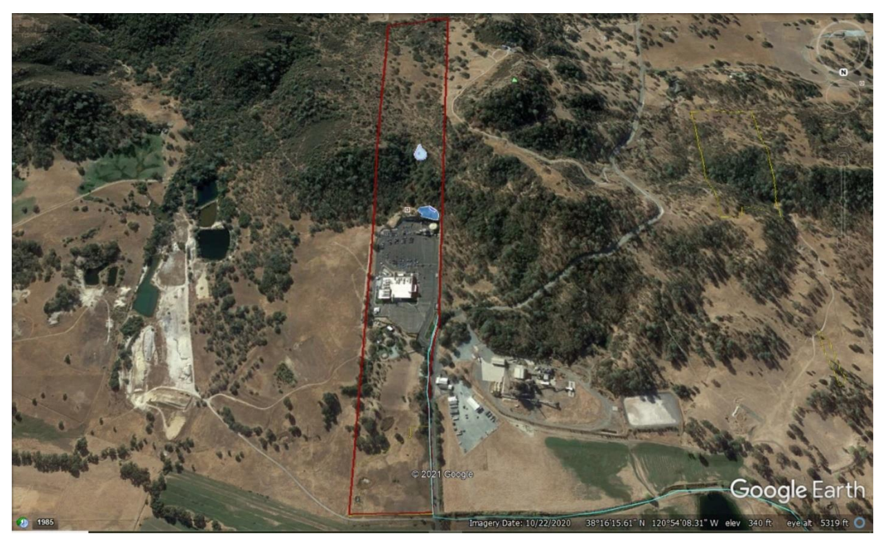
Maps from good Earth looking south