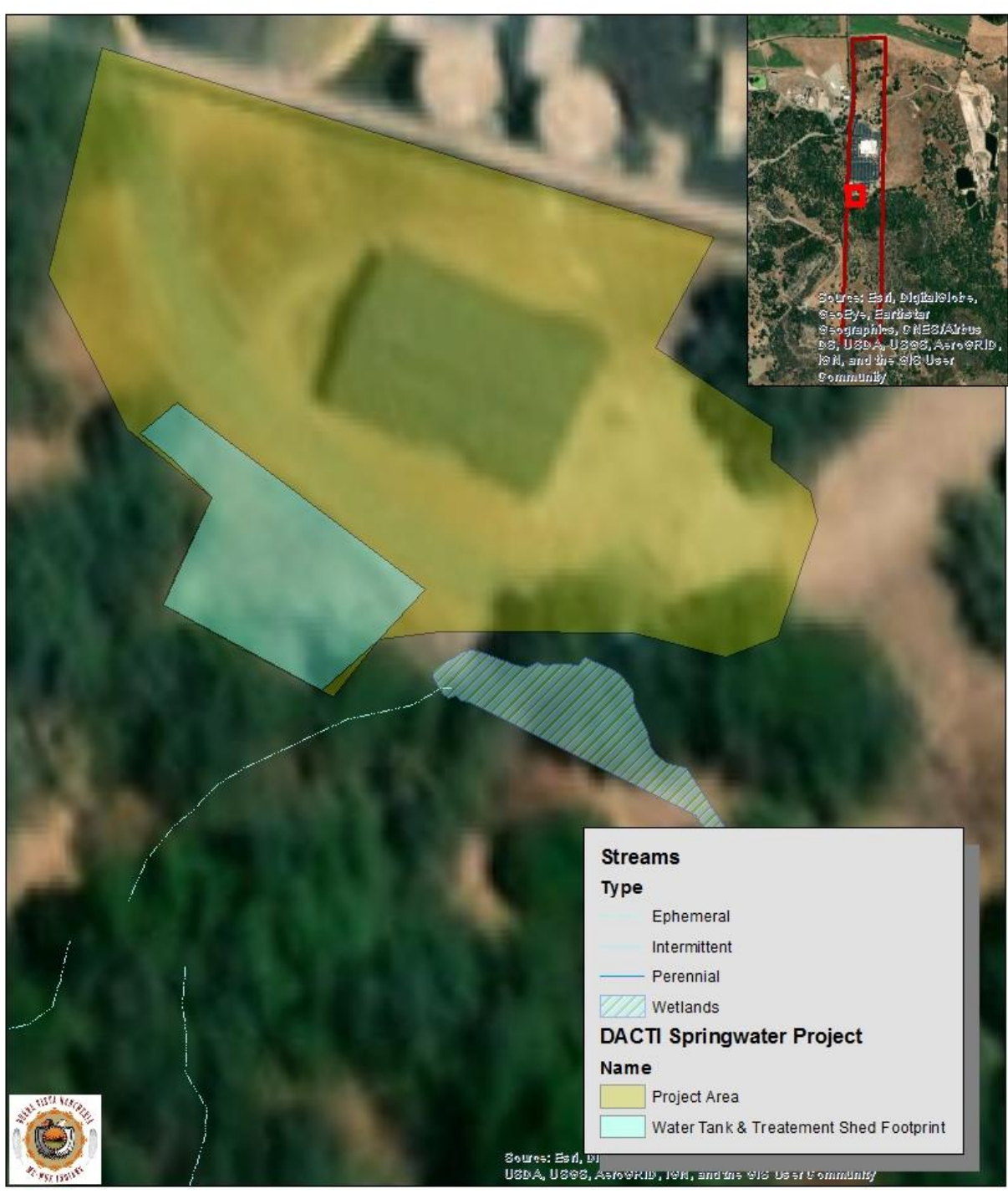
DACTI Springwater Improvement for Cultural Use Project 2021