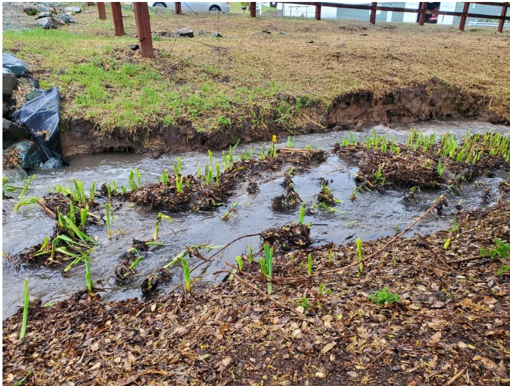
March 2022 stream bank erosion downstream of the rip rap