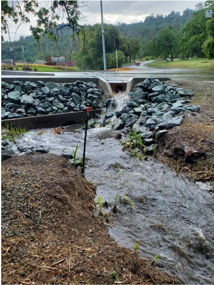
Stormwater discharge point March 2022