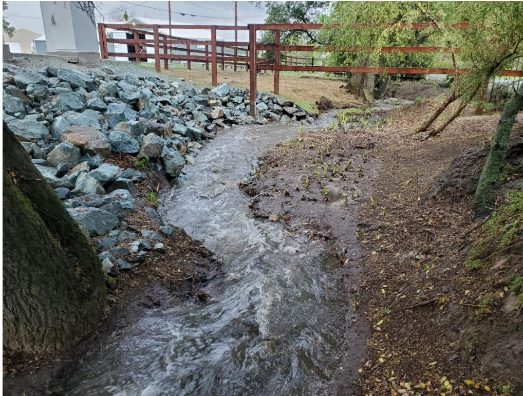
March 2022 after Casino staff installed rip rap on a section of eroded stream bank